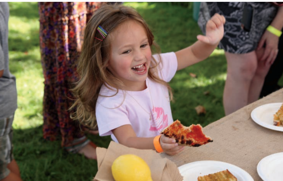
A young guest enjoys lunch at a special kids' area at the L.A. Loves Alex's Lemonade fundraiser.